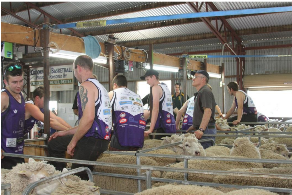
“Out the Back” at the 2018 Sports Shear Event